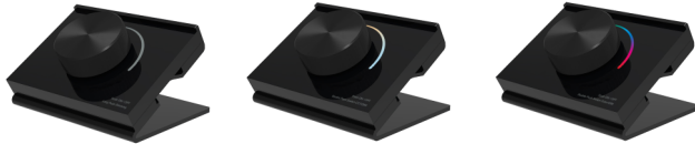
RK1 1 Zone Dimming

Rotary dimming/1-3 color/Wireless remote 30m distance/CR2032 battery