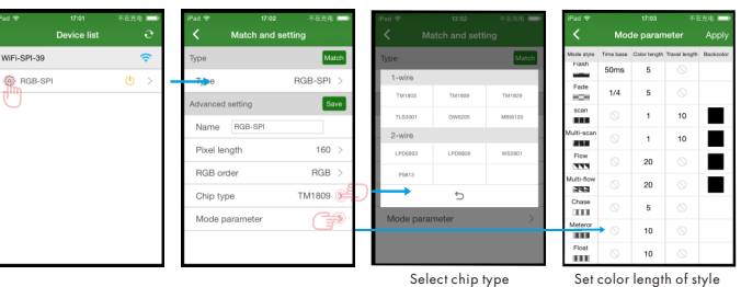
Set color length of style